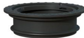
235mm Entrance Shaft