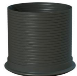
600mm Spacer Ring

Either a 235mm or 635mm entrance shaft must be used with the SD tank. A spacer ring can be used to extend the 235mm shaft. Vehicle duty lids and 635mm entrance shafts are available on request for driveways.