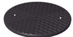
Pedestrian duty lid