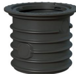
635mm Entrance Shaft