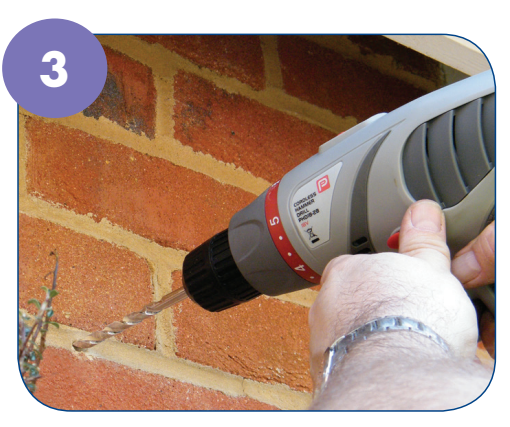
✔ Drill the fixing holes.