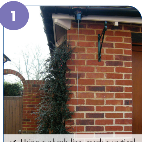
✓ Using a plumb line, mark a vertical line on the wall from the outlet to the drain.