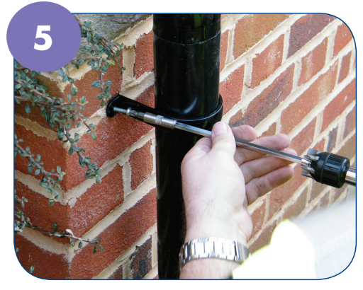
✓ Fit the pipe clips to the downpipe and screw them into the wall.